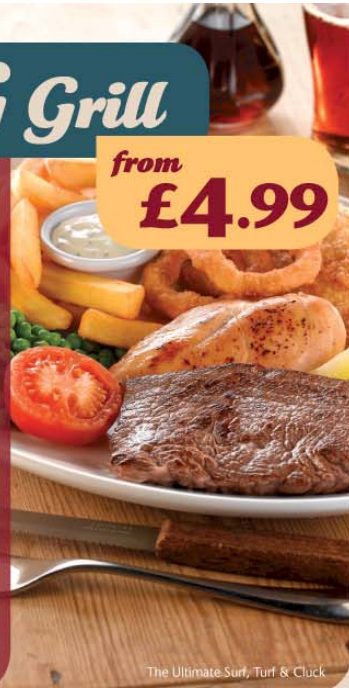
The Ultimate Surf, Turf & Cluck